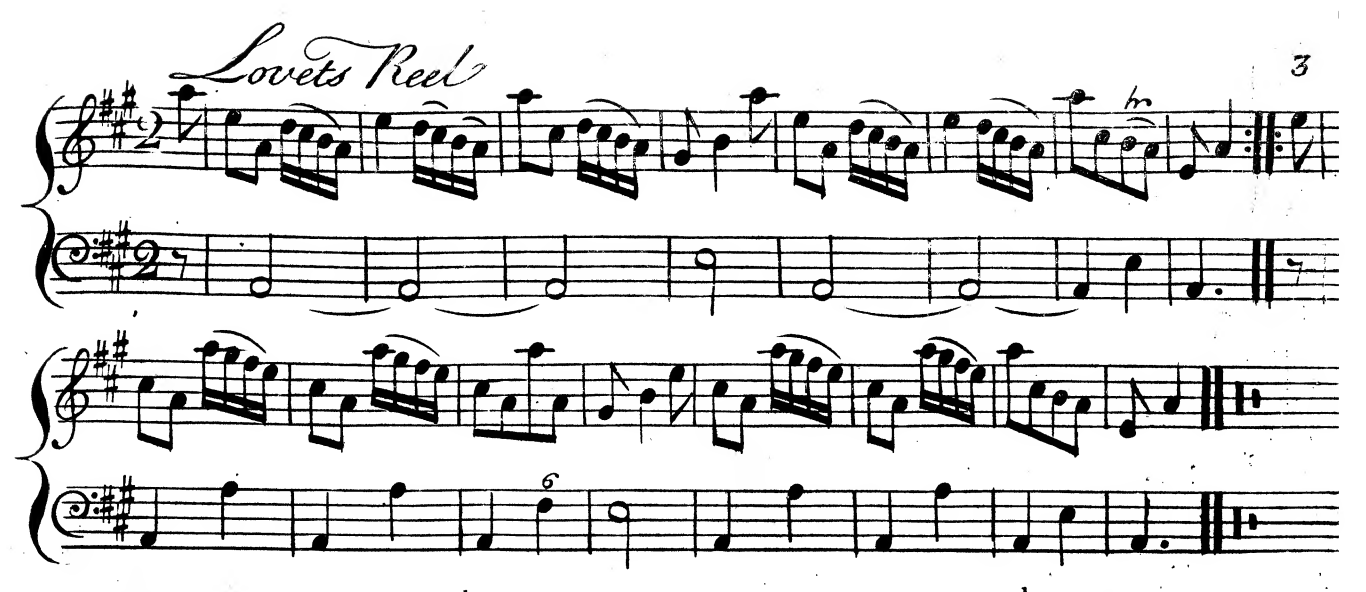
The first Man foot it to the 2<sup>d</sup> Wo. & cast off with his Partner into the 2<sup>d</sup> Cu. Place then the 2<sup>d</sup> Man foot it to the first Wo. & cast off with his Partner into their Places — Then the first Cu. take Hands & lead thro' the 2<sup>d</sup> Cu. and cast up to Top: Right Hand & left into the 2<sup>d</sup> Couple's Place and turn.